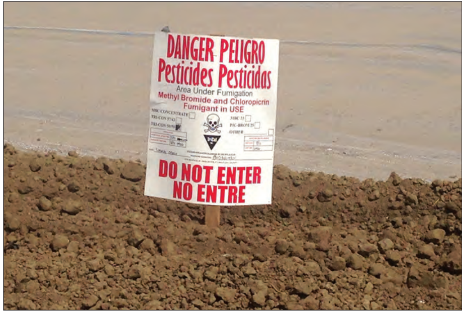
Warning sign at the edge of a fumigation.

Fieldworkers, by contrast, view the pesticides used at their worksites as