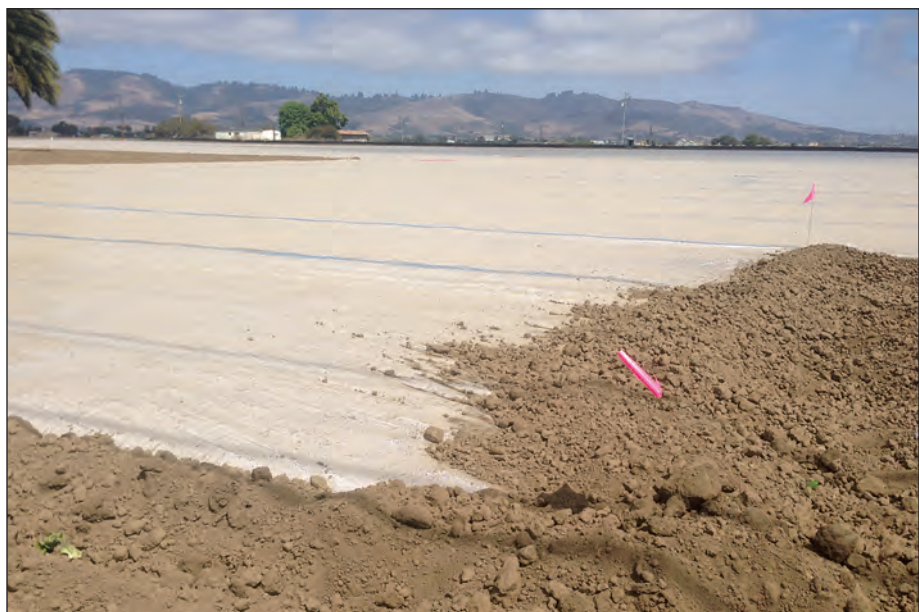
Dirt used to hold down protective tarps.

California strawberry growers appear to be experiencing an unusual labor shortage. The shortage owes to both heightened militarization of the border since 2001 and the pull of less arduous jobs in other crops and other industries. Growers widely complain about a lack of labor (Hertz and Zahner 2013; Tourte et al., 2016). One of the more interesting findings of this research is that the current agricultural labor shortage is much more concerning to strawberry growers than increasing regulations on soil