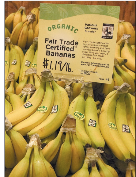
Women, Hispanic-Americans, and those who consider the environment when shopping may be most receptive to a domestic equivalent of the existing Fair Trade label.

Marketers. One of the most striking differences, evident in all three sections of the survey, was women's greater interest in ethical issues surrounding food production. Advocates of humane