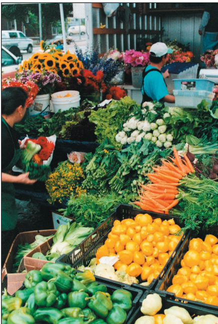
Consumers who frequently support farmers' markets and other local food sources are concerned with the wages of farmworkers and others who produce their food, as well as food production's environmental impact.