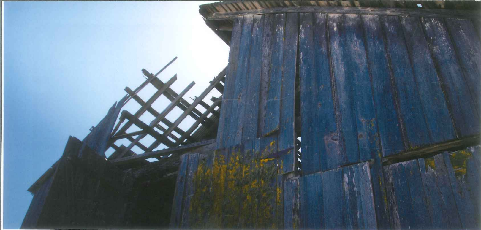
The historic Hay Barn was built in the late 1860s.