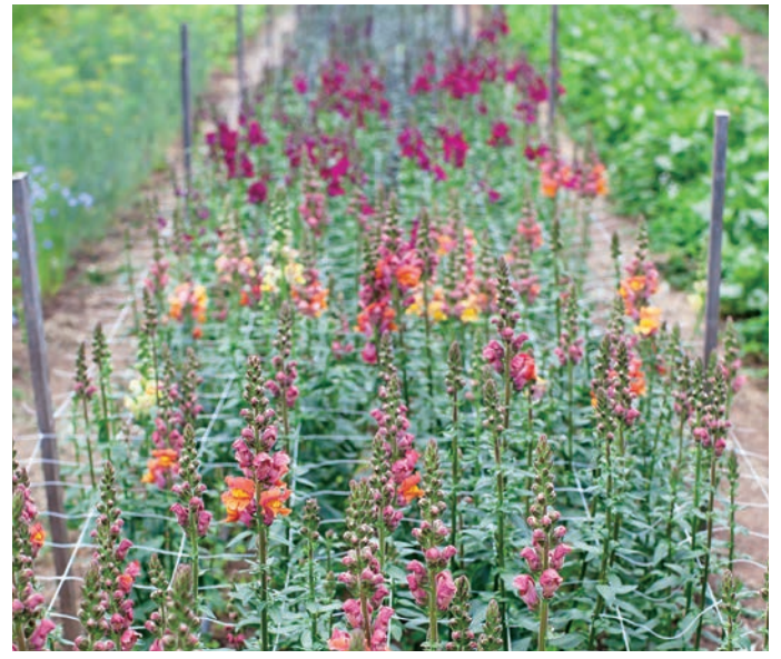
FIGURE 5. Netting helps ensure straight stems on snapdragons (Hortonova trellis, Peaceful Farm Supply).

Although cut flowers are bred and selected for naturally long, strong, straight stems, some species are worth growing but require extra support. Snapdragons, for instance, are famous for leaning, then self-correcting, resulting in bent stems.