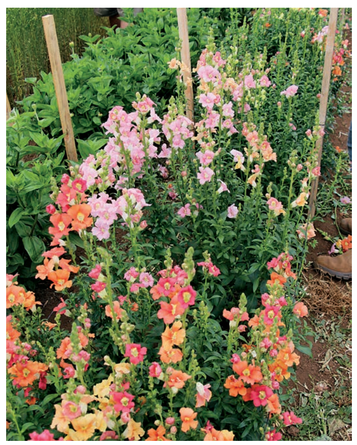
FIGURE 6. Stakes and twine support cut flowers.

Many species of flowers benefit from having the growing tip (apical meristem) pinched off to encourage branching and multiple blooms. See Table 2 for a list of plants that should be pinched, as well as those not to pinch.