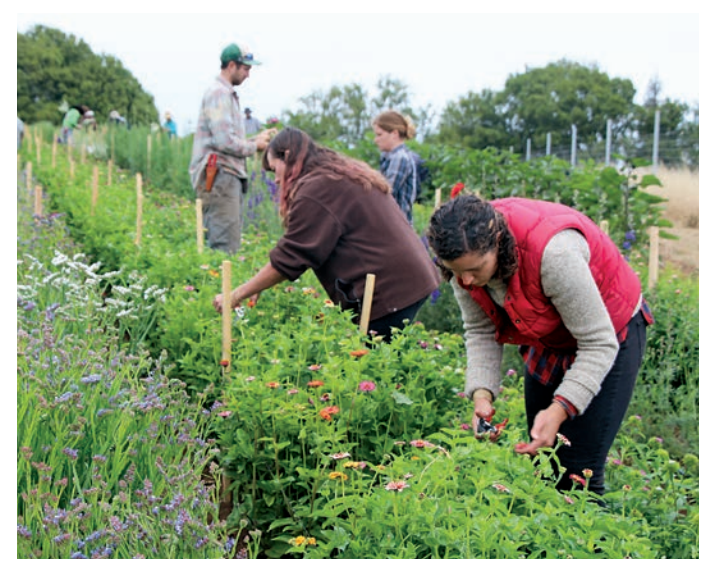
FIGURE 7. Early morning harvests take advantage of the flowers' cooler core temperature.

Herbaceous perennials (non-woody plants living more than 3 years) can complement annual cut flower production. Often the blooms (both form and color) are distinctive; even in small numbers they add a sophisticated look to bouquets, elevating both "eye appeal" and price. While all flower are a draw at direct marketing venues, perennials really distinguish themselves.