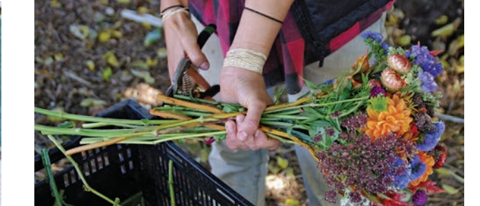
FIGURE 12. Cut stems to equal length for banding.

• Consider having one person arranging hand off of completed bouquets to another person who bands, trims, sleeves, and places in bucket.