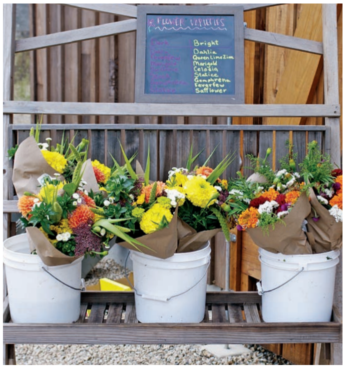
FIGURE 10. CSA members' bouquets ready for pick up.

Farmers' markets can be a great way to make connections and get your face and your product out there. Bringing flowers to market will naturally attract customers who want to support local growers for their special events. This type of word of mouth and networking can be the best marketing strategy.