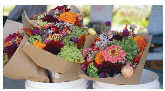
Fall bouquets.

Fall: Amaranth, Flowering Basil, Gomphrena, Rudbeckia, Sweet Annie