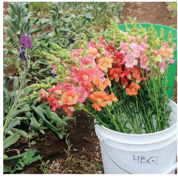
FIGURE 9. Long stems minimize damage in bucket.