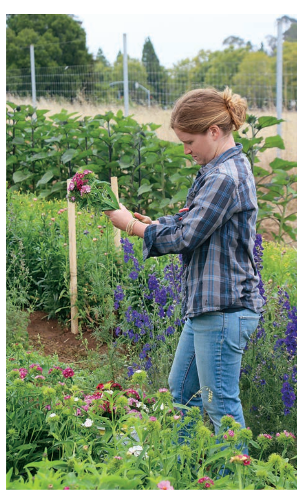
FIGURE 8. Bunching and banding single-species bunches.