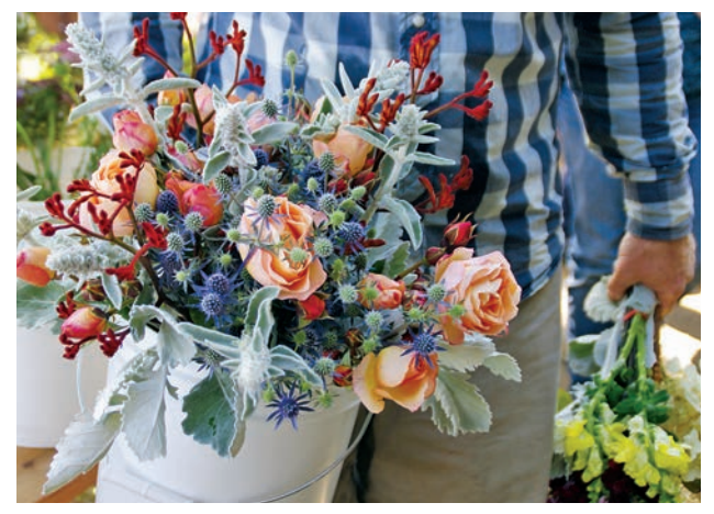
FIGURE 4. A mix of focal, filler, foliage, and accent flowers.