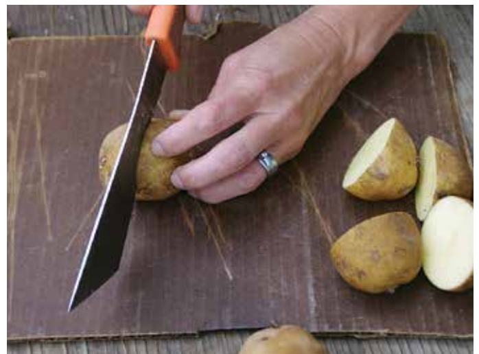
FIGURE 1. Preparing seed pieces for planting.

Seed potatoes that are large enough can be cut into smaller pieces to extend planting stock volume. Cut tubers into