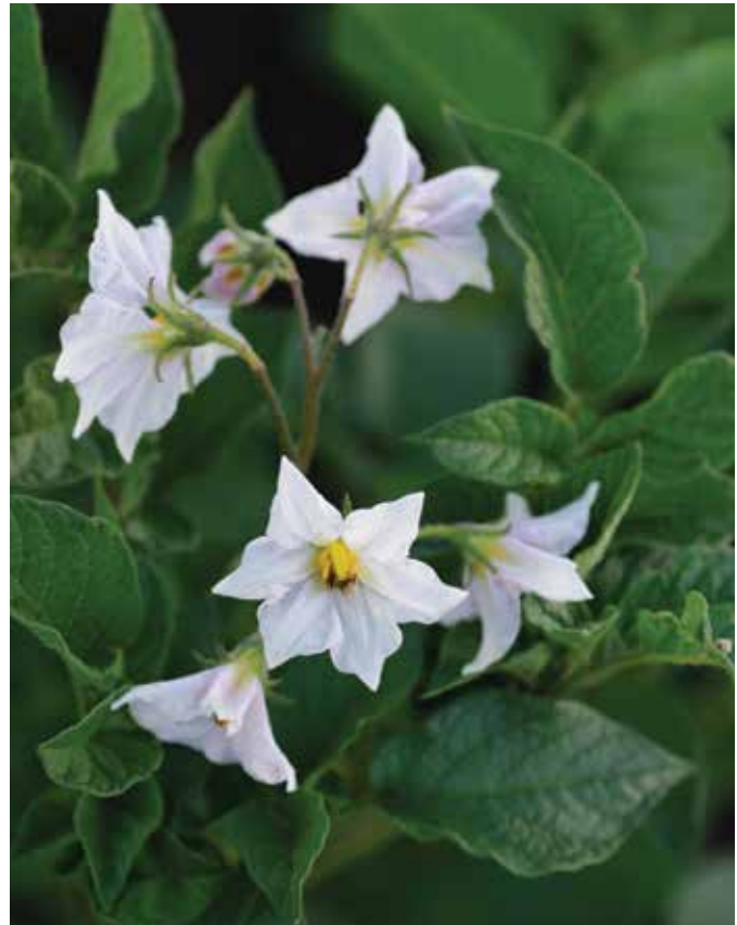
FIGURE 6. Potatoes begin to flower at approximately 40–50 days post planting.

Tubers enlarge, increase in starch content and individual varietal characteristics. Skins set and thicken, allowing for long-term storage.