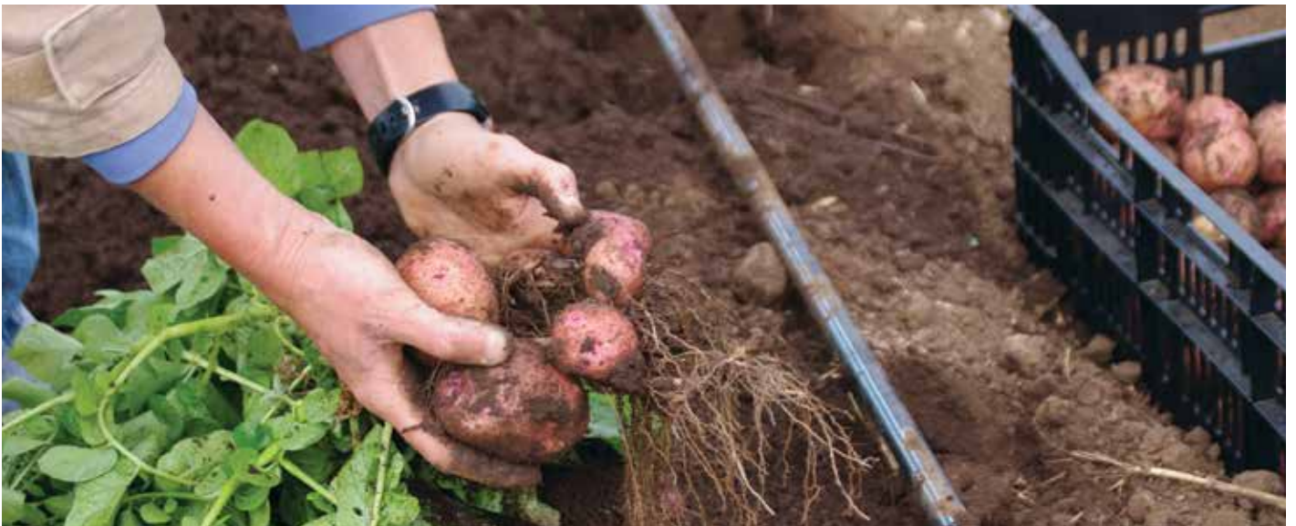
FIGURE 8. Handle new potatoes gently to avoid damaging the fragile skins.