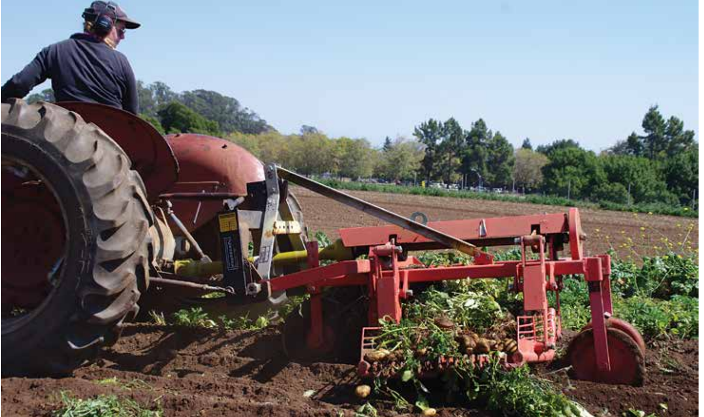
FIGURE 9. Example of a PTO-driven harvester with “shaker cage.”