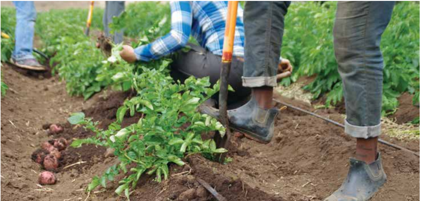
FIGURE 7. Harvest new potatoes using a garden fork.

Use a dedicated potato harvester or an under-cutter pulled behind a tractor for mechanized harvest. For potato production areas much larger than one-quarter acre, it is best to harvest mature tubers with a dedicated potato harvester, such as a single-row PTO- operated digger with an undercutter bar and shaker cage. The harvester lifts the spuds and leaves them on the soil surface to pick up (Figures 9 and 10). Break the furrow tire compaction with chisels before harvest to ensure that the under-cutter or harvester can get below the lowest tuber and work effectively.