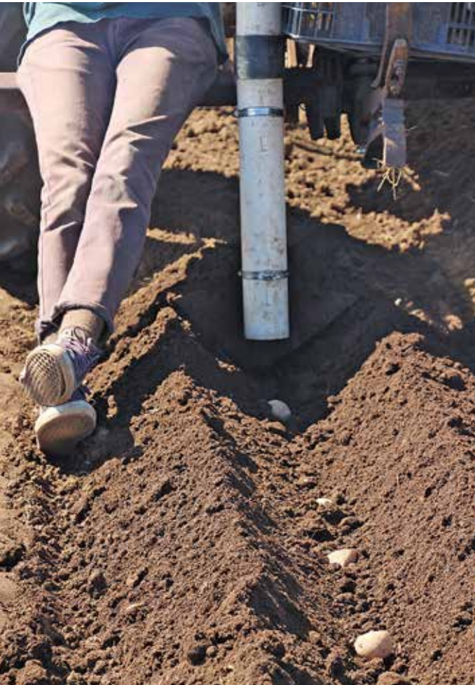
FIGURE 3. Plant potato seed into furrows created by furrowing or Alabama shovels.

1.5–3-ounce pieces (a little larger than a hen's egg) with at least two "eyes" on each cut piece (Figure 1). Cut through the center of the potato and allow the cut to heal over for 3 days prior to planting. Seed cut immediately before planting may experience decay in the ground, especially if soil is too dry or too warm at planting.