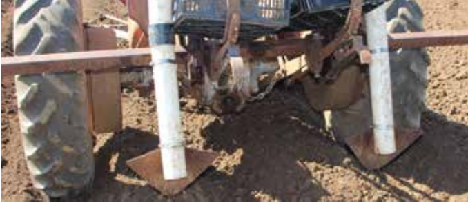
FIGURE 2. Alabama shovels with "drop tubes" for placing seed pieces.