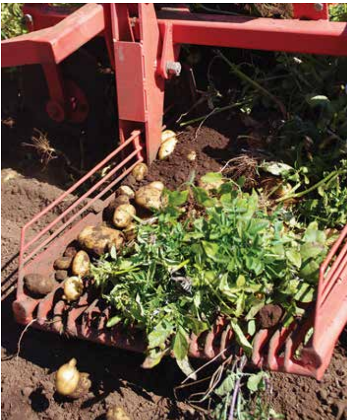
FIGURE 10. Shaker cage deposits harvested potatoes on the soil surface.