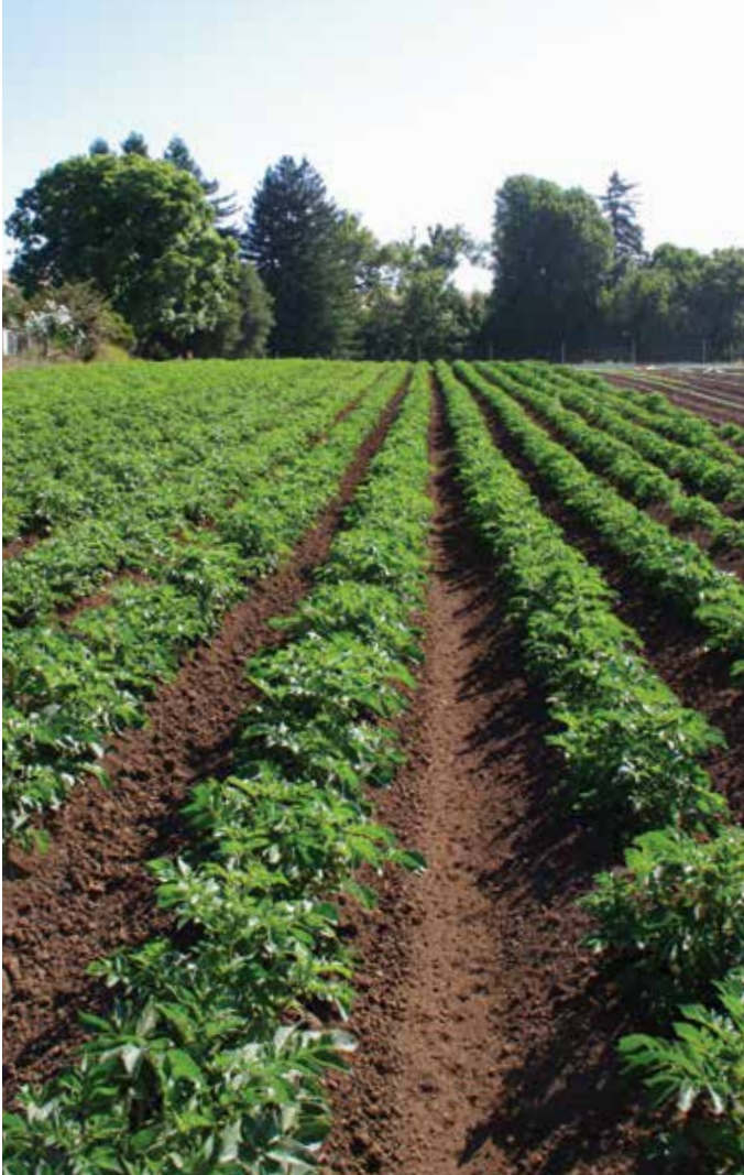
FIGURE 5. Hilled potatoes at the UC Santa Cruz Farm.